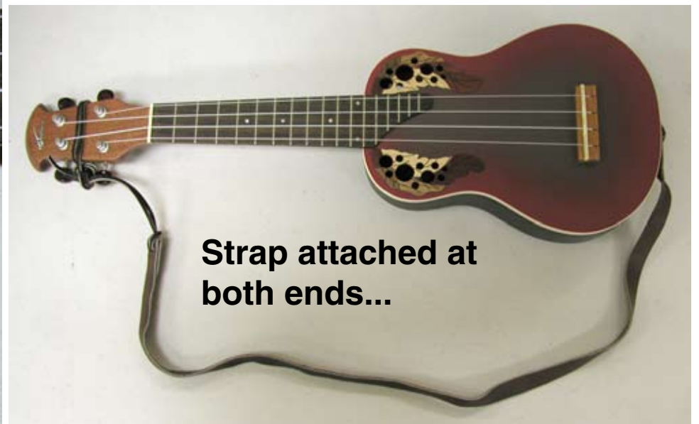
Strap attached at both ends...